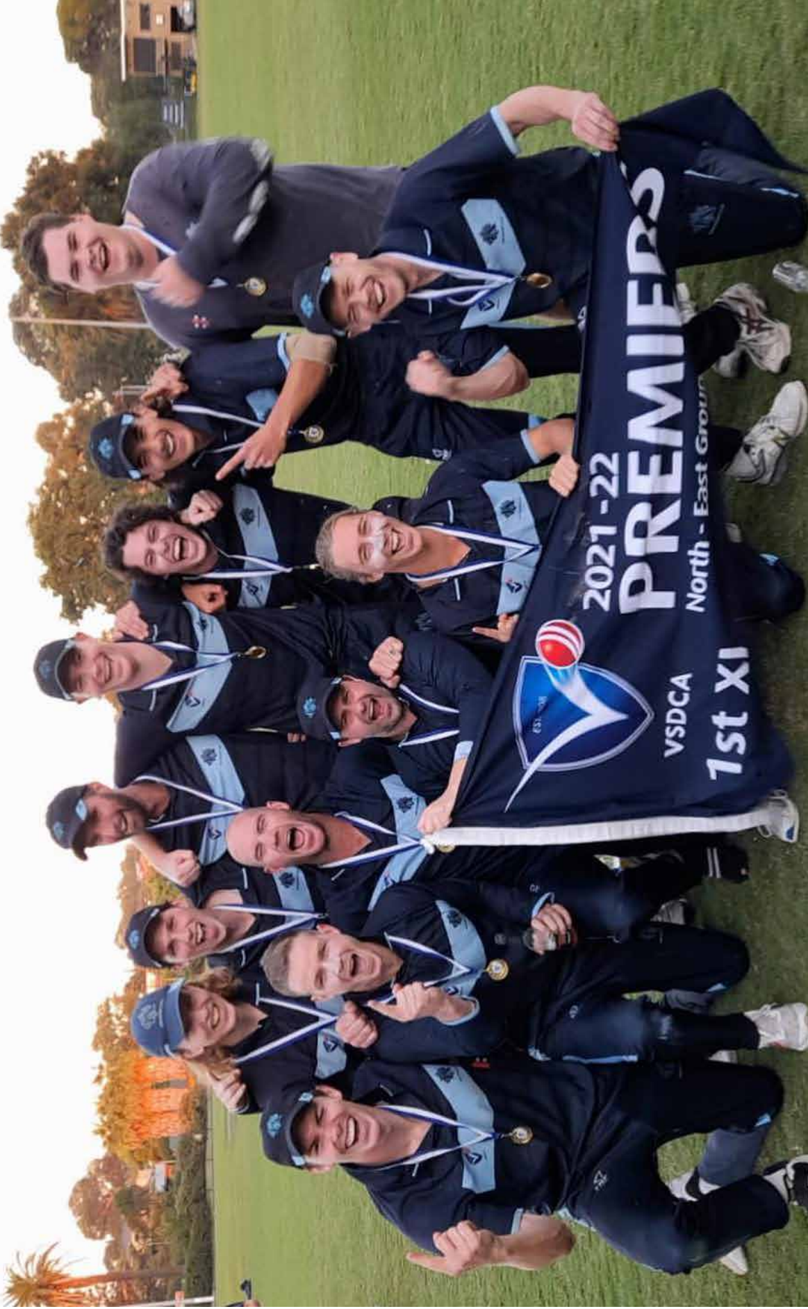
North/East 1 st XI Premiers