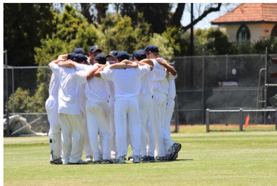
The Balwyn huddle