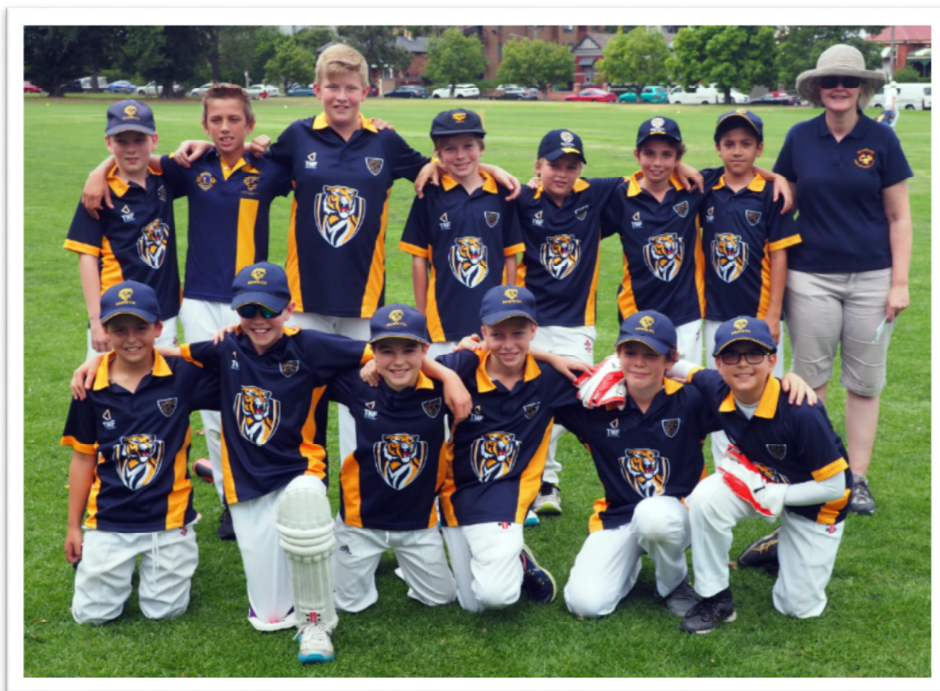
Balwyn Under 12s

The Under 12 award winners for the season were: