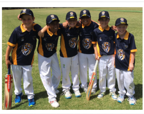
Under 10 Black

The Under 10 award winners for the season were: