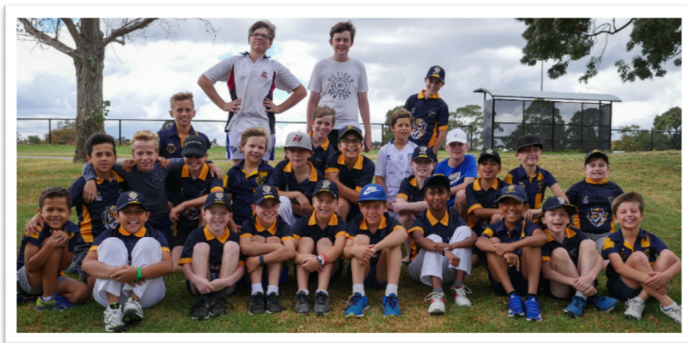
Balwyn Juniors Presentation Day, March 2018