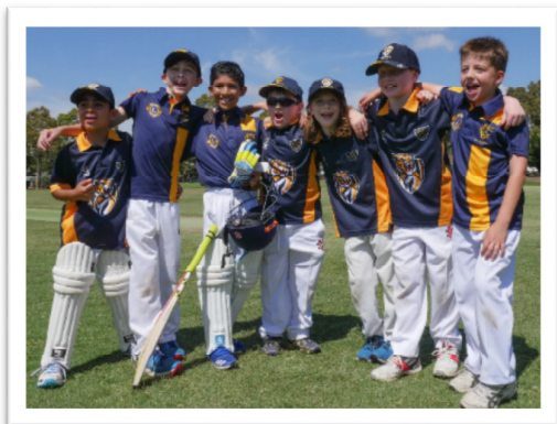
Under 10 Yellow