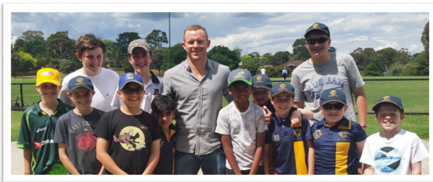
Balwyn juniors with Chris Rogers at the Presidents Lunch, November 2017

With most of the action occurring on the field, the boys were treated to a special day at the Presidents Lunch in November where they got to meet former Australian Test Opening Batsman Chris Rogers. After some entertaining Q&A, Chris spent some time with the boys signing autographs and giving tips on the basics of batting.