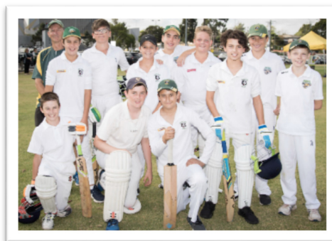
Deepdene/Balwyn Under 14s