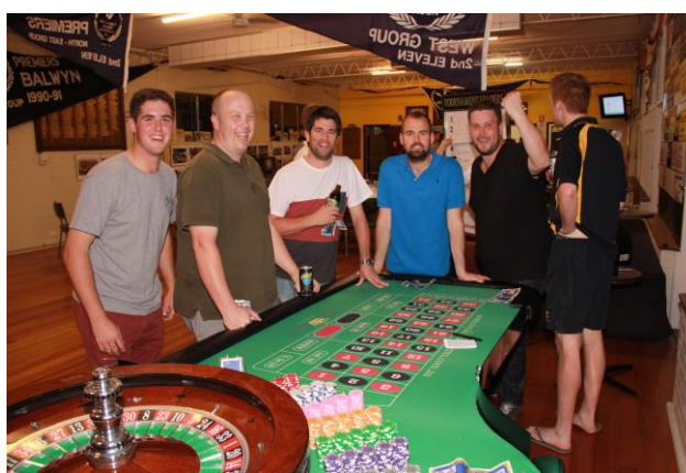
More fun at the roulette table