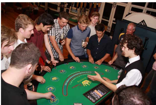
A packed blackjack table at the Casino Night