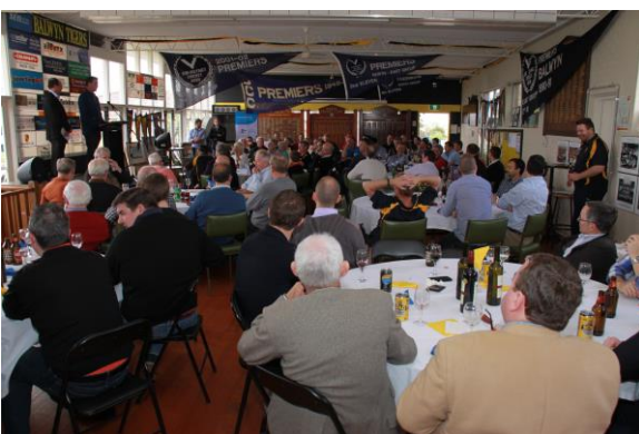
Hon Sec provides the Club's reply to a full house