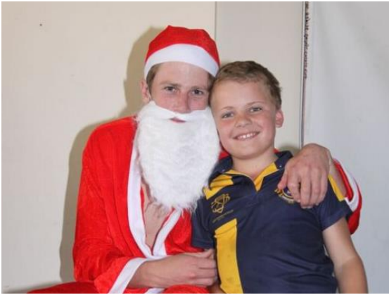
Santa handing out presents to the juniors