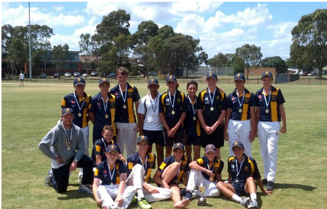
The victorious JG Craig Shield Winners