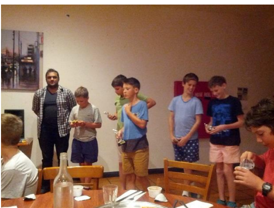
Award winners at the Junior Presentation Night