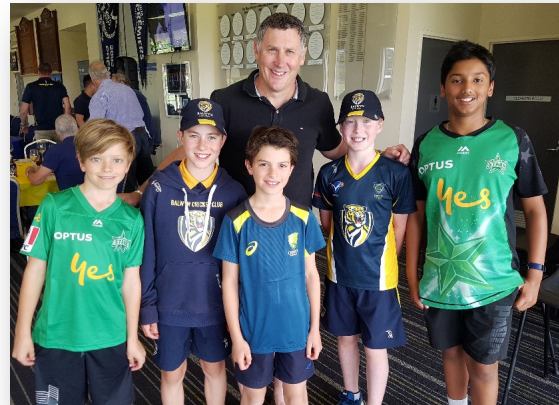
Guest Speaker Mike Hussey at the Balwyn Presidents Lunch

Congratulations to all players for their efforts this season. Well done on a solid year. We look forward to seeing you all again next season.