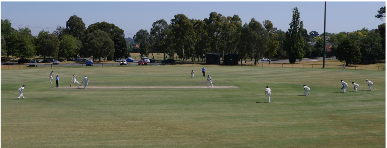
The view from the balcony as Steve Duckworth sends one down in the 1 st XI Semi Final versus Noble Park