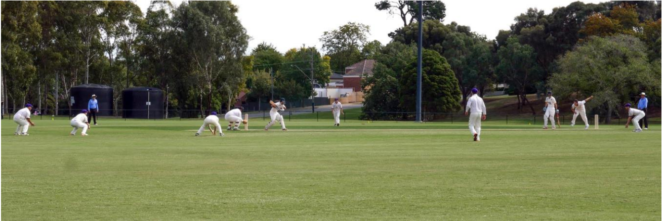
Guy Looker faces Shannon Clarke in the 1 st XI Grand Final vs Altona